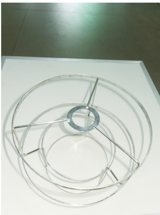
Production workshop display

Multi function looping machine, widely used, can be used as long as it is a flat iron circle or a flat iron circular arc Convenient setting, automatic counting, punching cylinder can be one cylinder or two cylinders according to needs