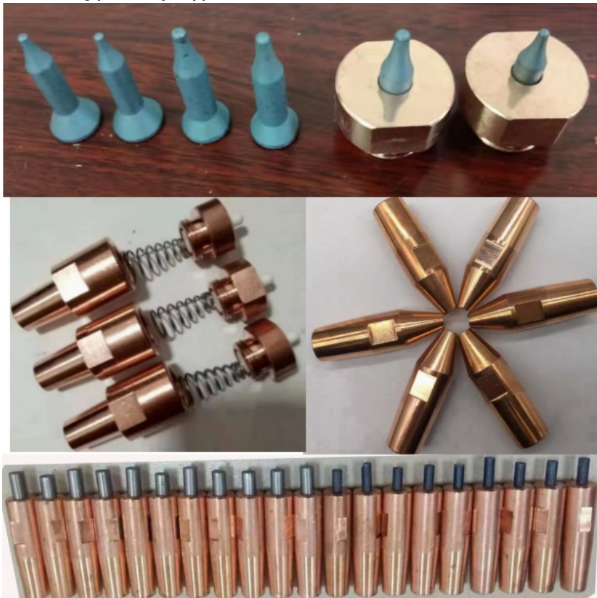
Feeding nut shaped display