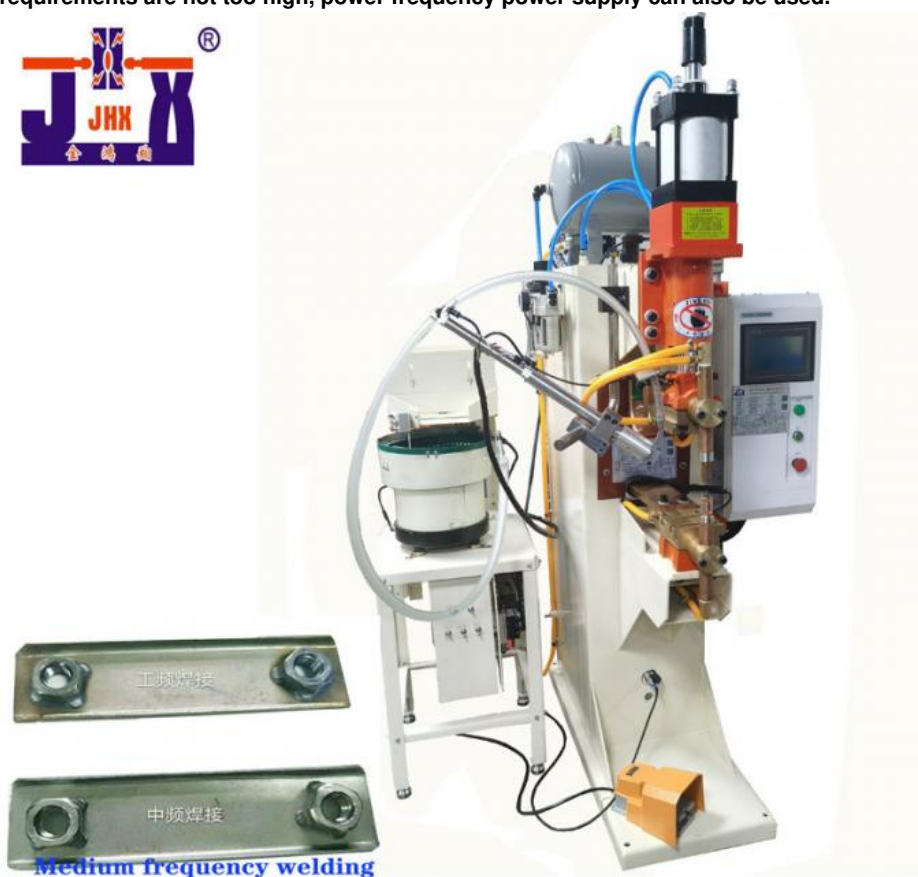
Medium frequency welding